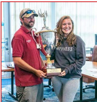
Bennet Cup Award Winner