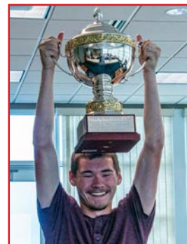
Schroder Cup Award Winner